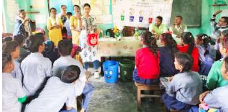
Three-bin system demonstration at a local school