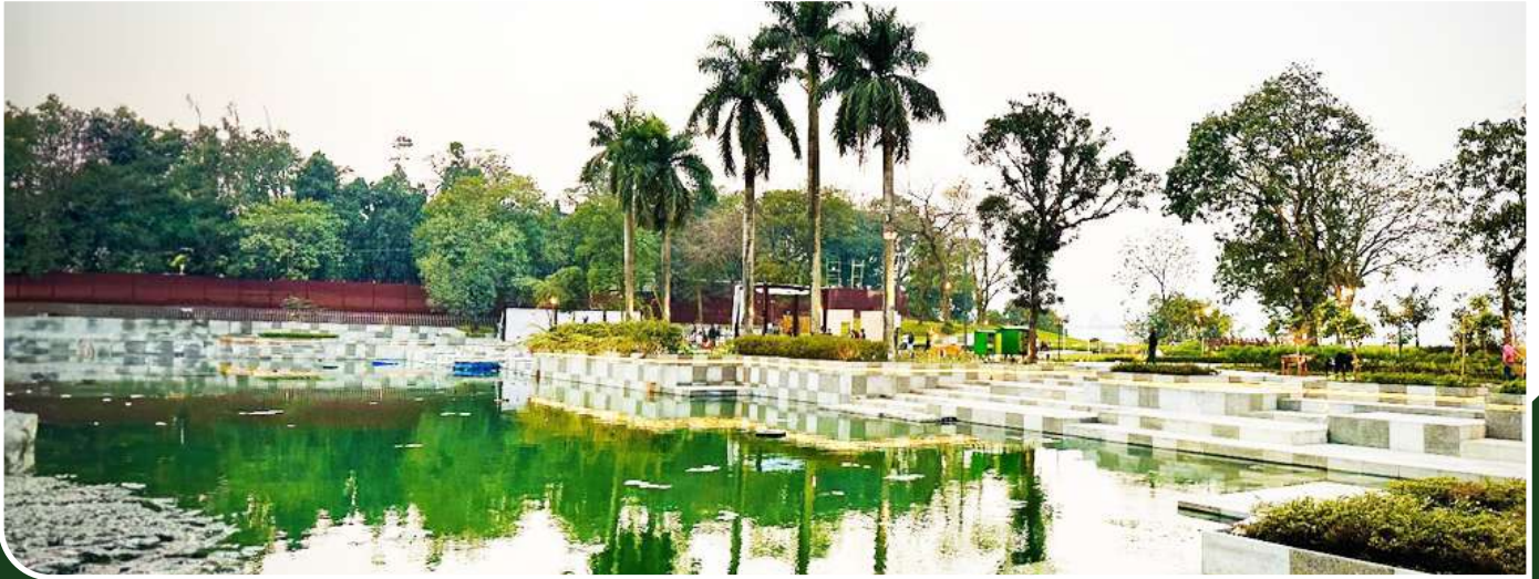
Brahmaputra Riverfront, Panbazar, Guwahati