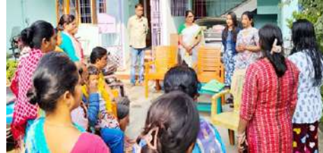
Community meetings driving waste management awareness.