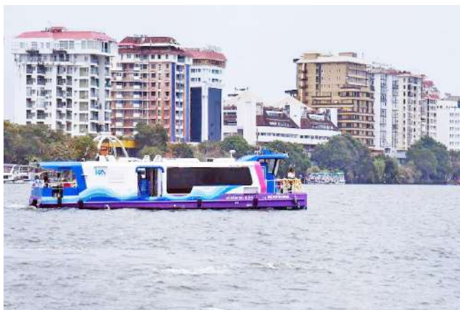
Barcelona's Superblocks: Reclaiming Streets for People