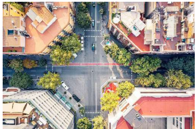
Superblocks can transform the urban landscape. They create more welcoming and inviting spaces that are more pedestrian-friendly and less car-dependent