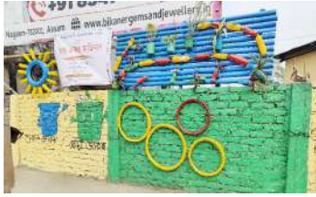
Yellow Spot transformation in Panigaon