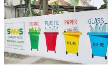
Wall paintings at Marwari Hindi High School promoting segregation