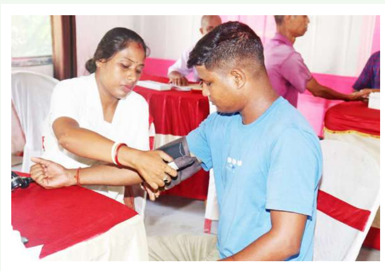
Health check-ups for Safair Karmacharis under the aegis of Bongaigaon Municipal Board

*This column is part of our Revolving Editor's Desk featuring monthly articles which highlight diverse perspectives from officers of DoHUA.*