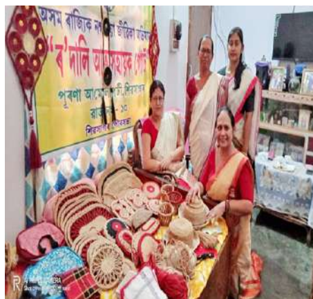
Ushakiron SHG members with their displayed products

The nation witnessed the splendor of their creations, and the world saw the beauty born from their hands, hearts and unwavering dedication. Their participation left an indelible mark, celebrating both their achievements and Assam's vibrant cultural legacy.