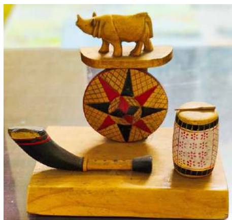
Products made by Ushakiron SHG