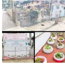
Transformed GVP on R.K.B Road, Christianpatty.