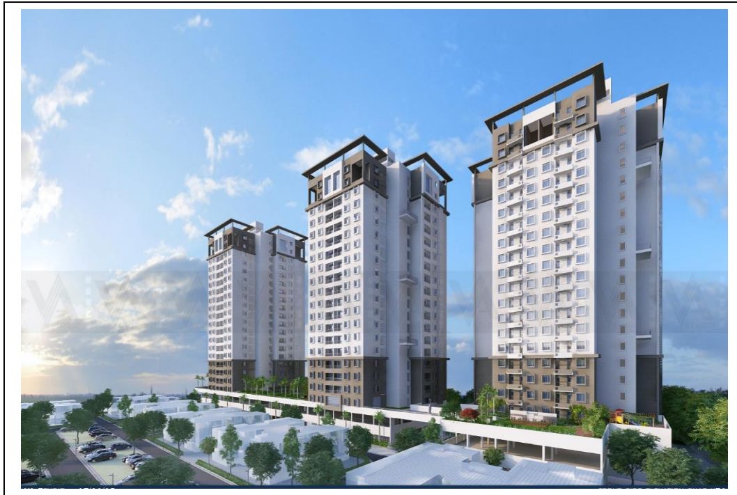
3-D View of Tower 1,2 & 3