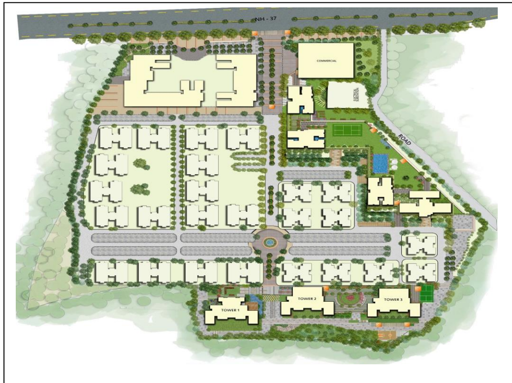
SITE PLAN FOR PH-II

Structural Consultant: M/s S.P.A Consultants, Kolkata