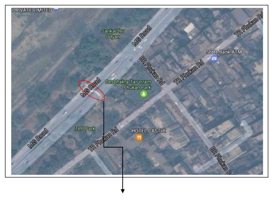
FOB at Bharalumukh