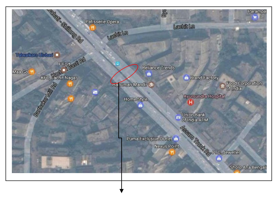
FOB at Lachit Nagar