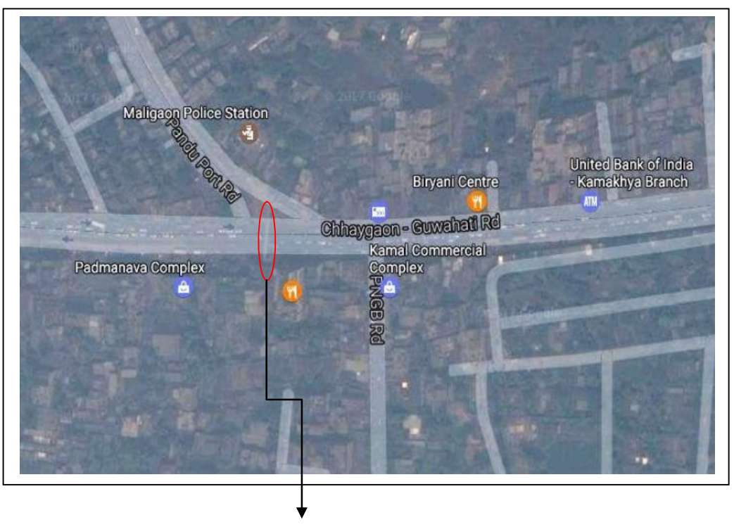
FOB at Maligaon